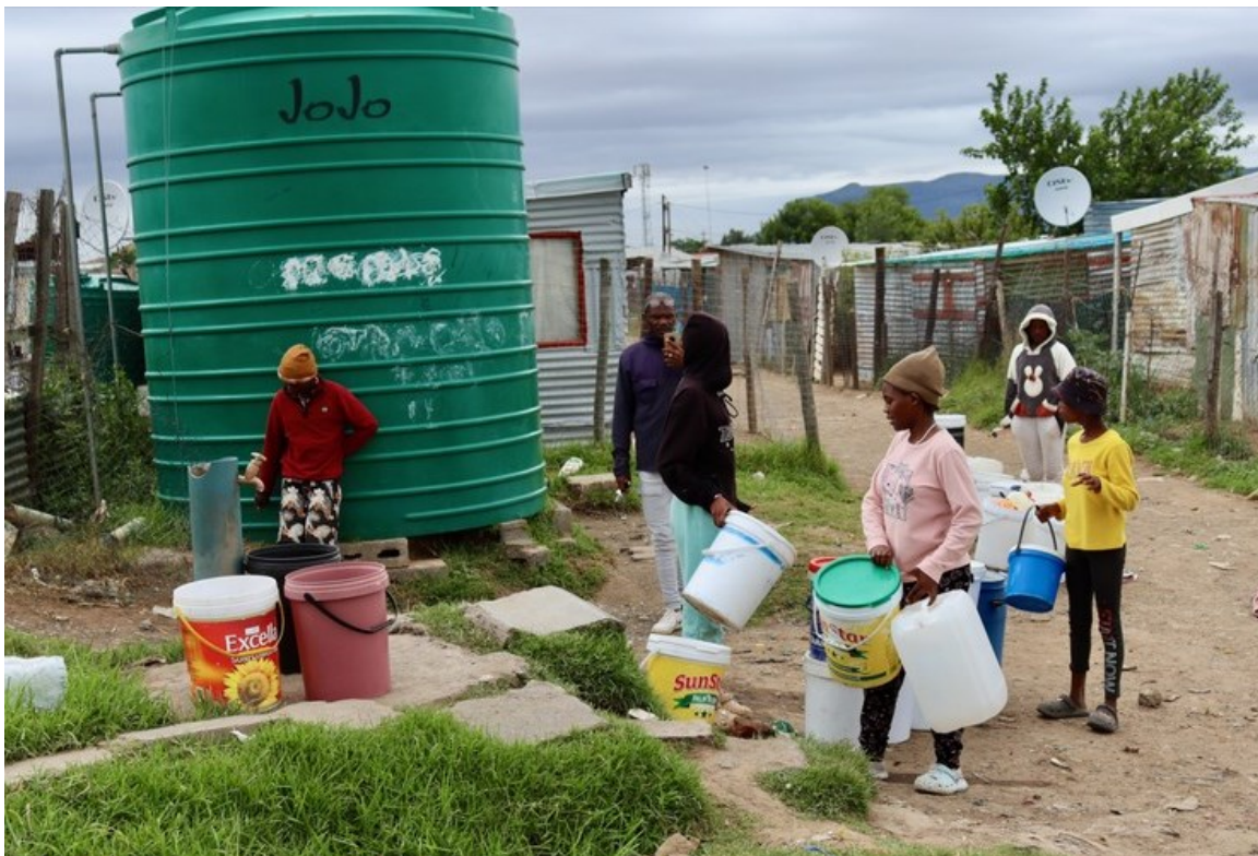
Instead of being at school these kids in Komani have to fetch water in the mornings.

As of February 2024, South Africa's debt was around R5.2 trillion, or 74% of the country's GDP. This debt is expected to increase to R6.3 trillion by 2027.