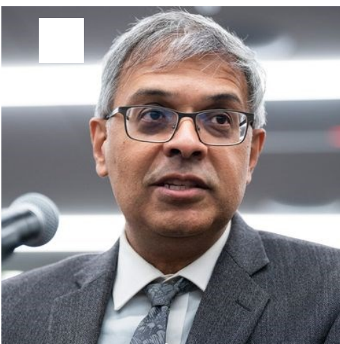
Anti- Vaccine denialist Dr. Jay Bhattacharya,

We must be under no illusions. There is no such thing as a "benign capitalism." The system's eternal mantra is "ownership, growth, profits." At any cost.